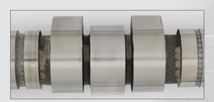
After rigorous third-party testing, the cam lobes show little-to-no wear.

Signature Series Synthetic Motor Oil develops a strong fluid film that keeps metal surfaces separated. Its robust anti-wear additives further reduce wear in metal-to-metal contact regions for maximum engine life. The Sequence IVA Engine Test, which must be passed to meet the API SN PLUS specification, simulates extended periods of stop-and-go driving. For 100 hours, the test engine cycles between 50 minutes of idling and 10 minutes of elevated rpm — conditions that encourage engine wear. The camshaft is then measured for wear in 84 locations and an average score is determined. We used Signature Series 0W-20, the lightest viscosity in the line, to further increase the severity of the test. AMSOIL Signature Series Synthetic Motor Oil provided 75% more engine protection against horsepower loss and wear¹ than required by the industry standard, extending the life of vital components like pistons and cams.